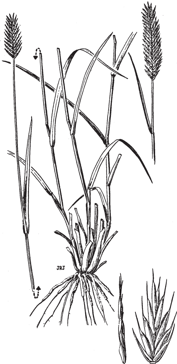
Figure 1. Crested wheatgrass ( Agropyron cristatum ) occurs primarily in northern New Mexico and can cause severe outbreaks of grass tetany.

most often while grazing cool-season grasses or small-grain pastures in spring or fall. Rapidly growing, lush grasses are the most dangerous. Grass tetany has occurred on orchardgrass, perennial ryegrass, timothy, tall fescue, crested wheatgrass, bromegrass, and winter annuals, such as cheatgrass. The small-grain pastures include wheat, oats, barley and rye. Grass tetany also occurs when livestock are wintered on low magnesium grass hay or corn stover. It is not usually a problem on legume pastures or in animals wintered on legume hay.